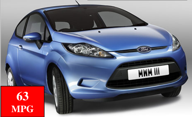
Ford Fiesta EConetic Diesel Available only in Europe