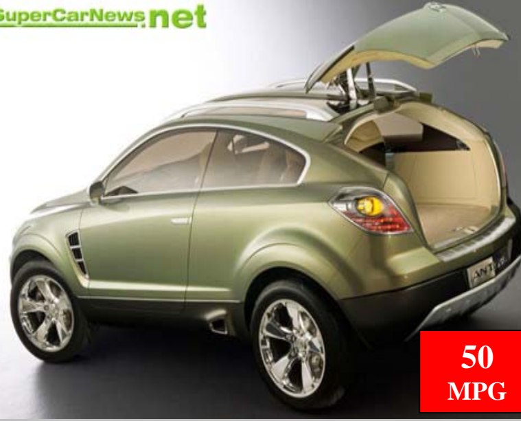
General Motors Opel Antara Available only in Europe